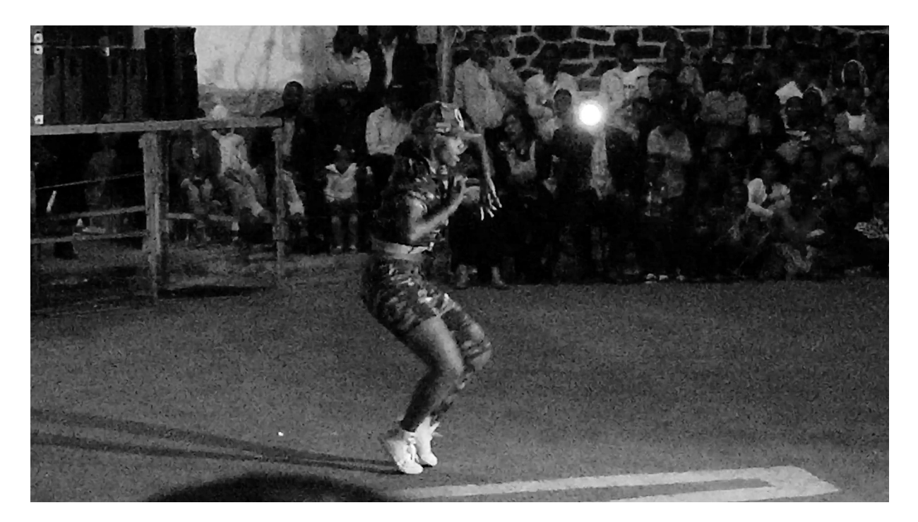
Impression / videostill in the streets of Asmara on May 23rd, during the festivities for Independance Day. Performance of South African dancers for the street concert of Habib Koite (Video: K. Graubner).